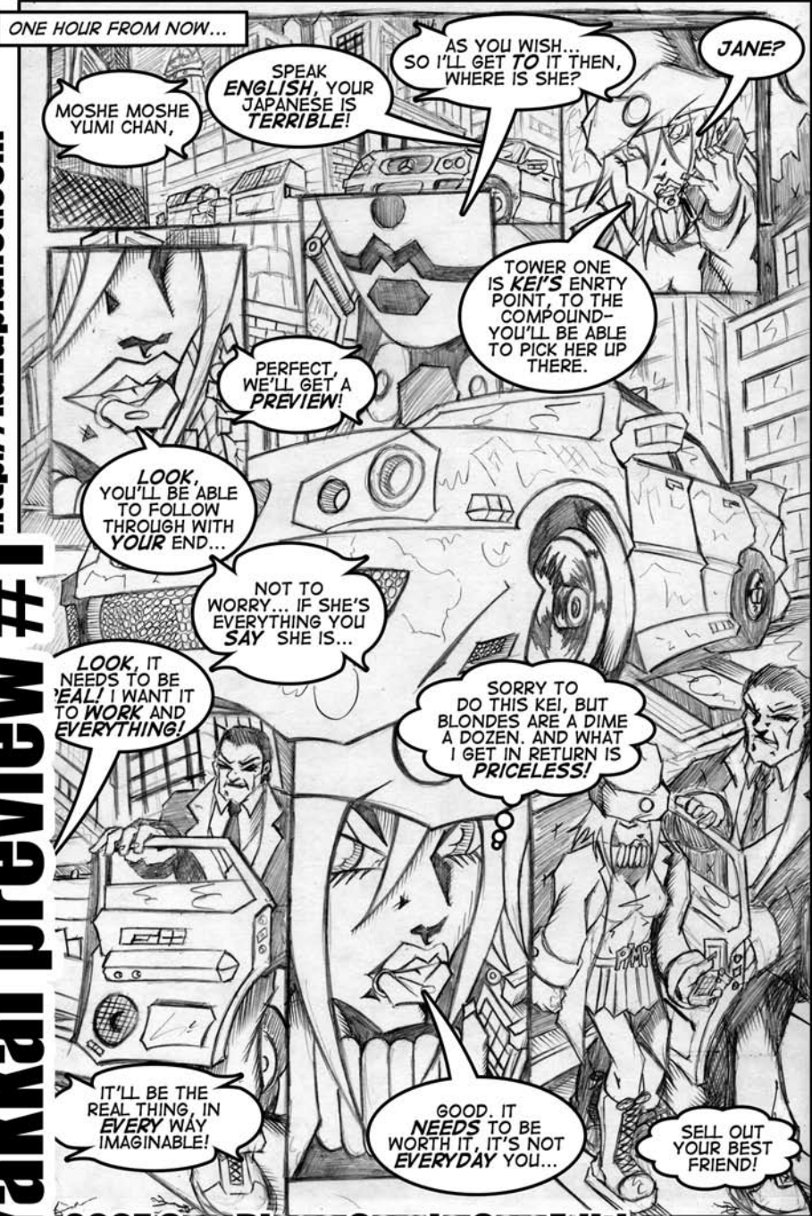
2007 San Diego Comic Con Edition