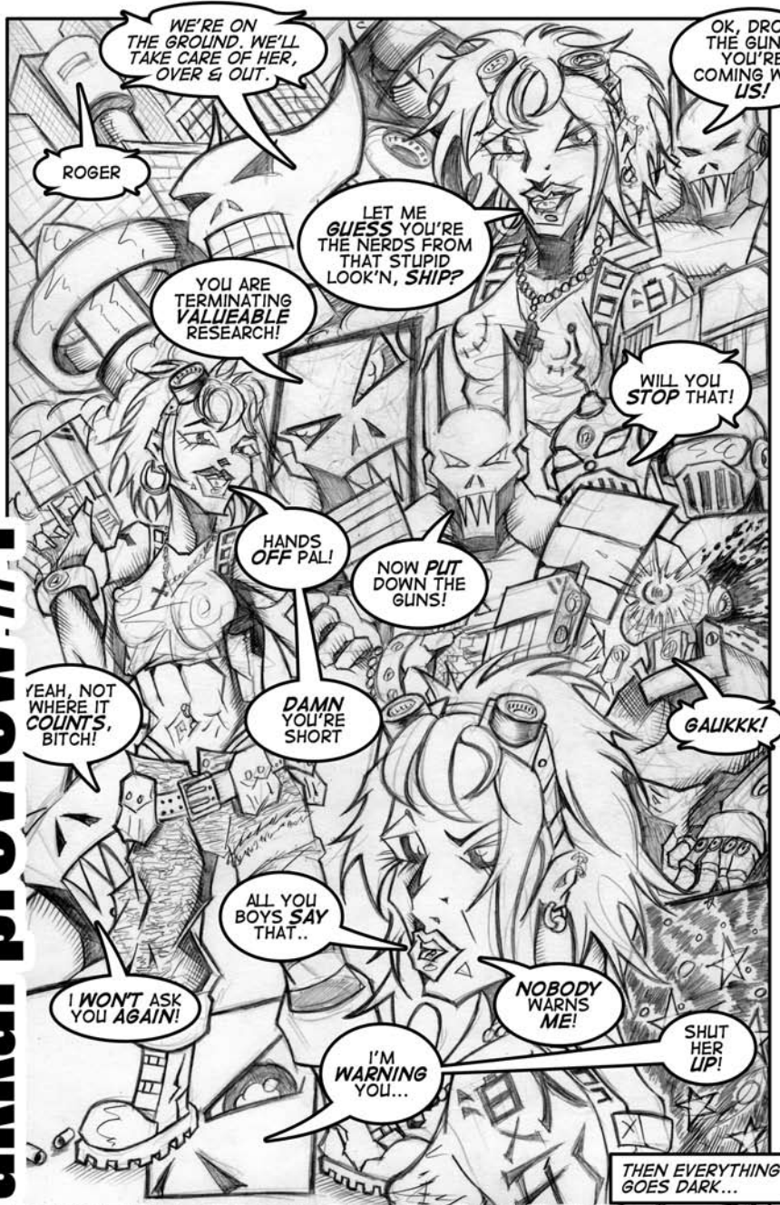
2007 San Diego Comic Con Edition