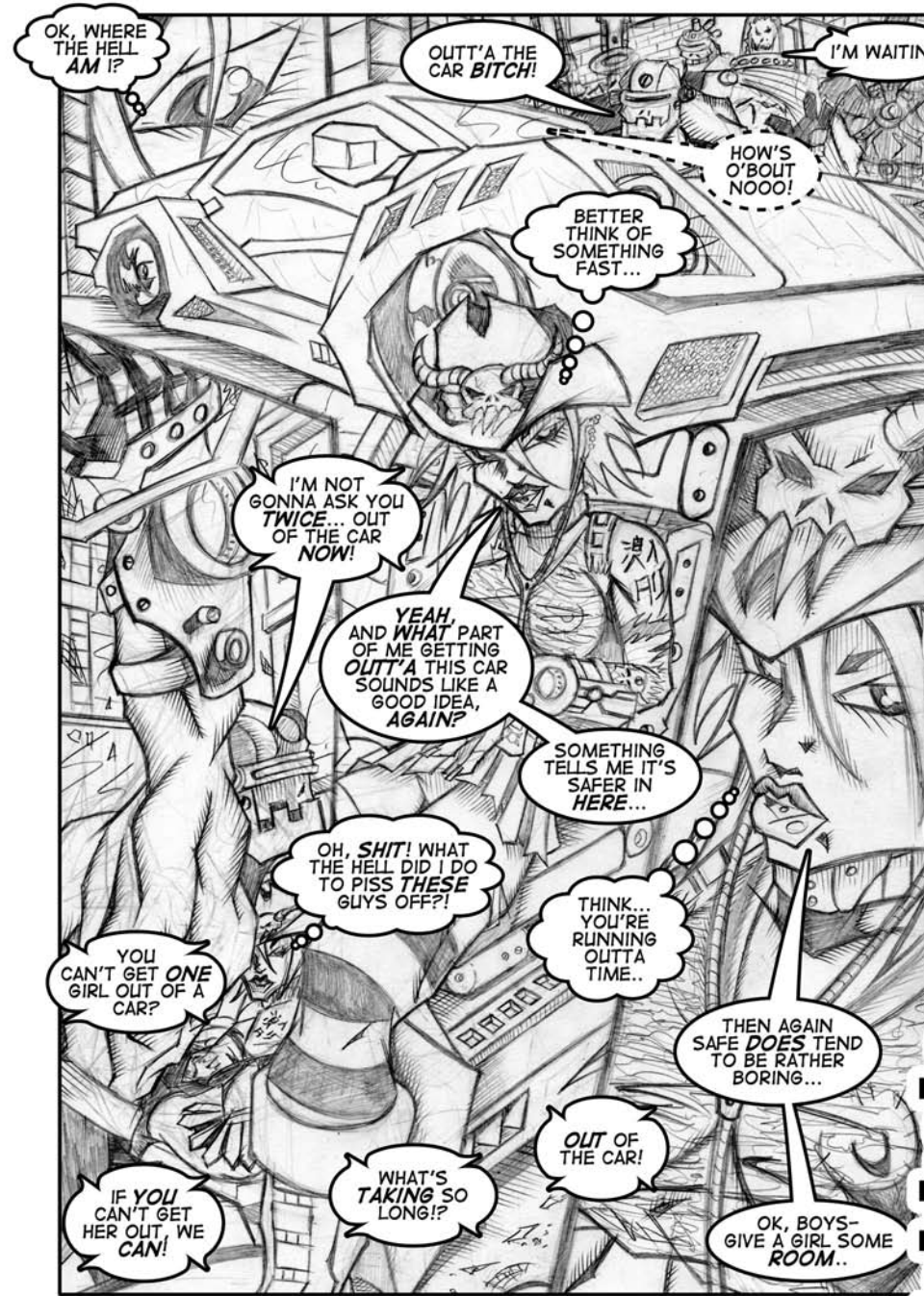
2007 San Diego Comic Con Edition